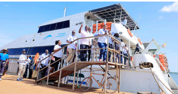
Some of the participants of the 3 rd PFM Conference boarding a boat for a joy-sailing activity organised by ICPAU on 24 April 2025 at Nakiwogo Landing Site.