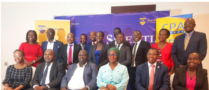
The CFO Graduates with organisers