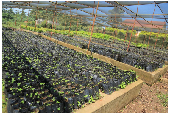
Hass Avocado nursery bed at Musubi Farm, Buntaba-Gayaza.