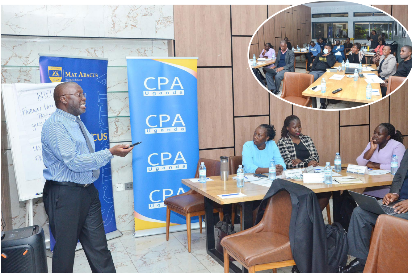
Participants at the 3 rd Quarter of the CFO Leadership Academy held at Fairway Hotel, Kampala.