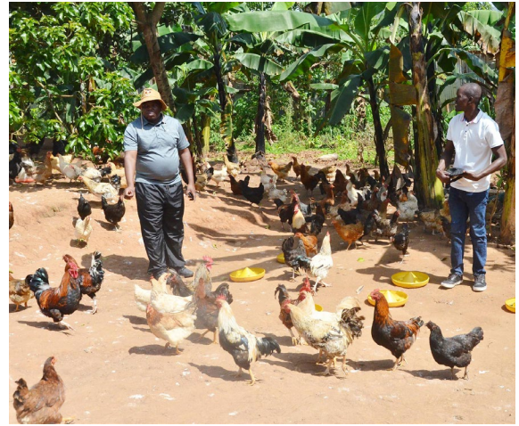
A cross-section of activities undertaken at Masheda Palms.