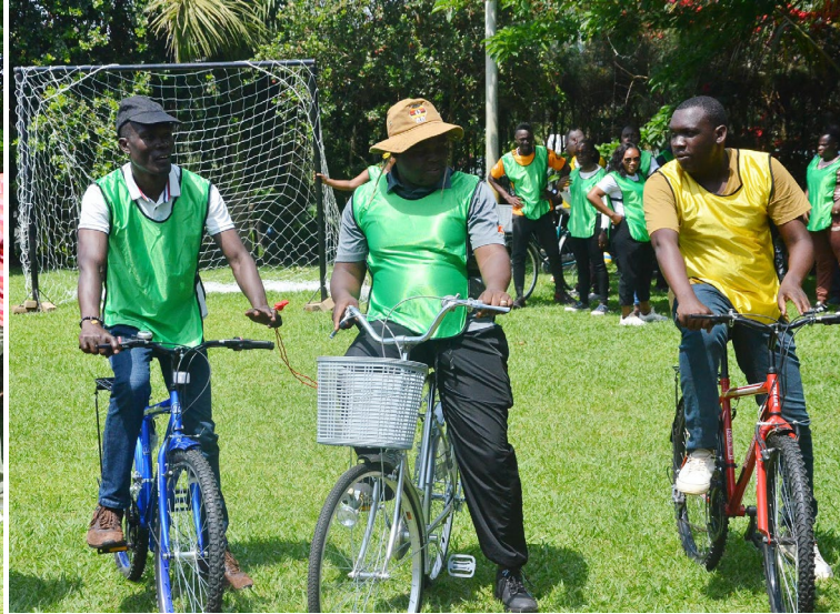
ICPAU Staff engaging in games and sports activities at Masheda Palms during the staff retreat.