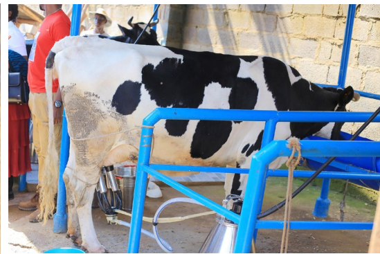
Some of the activities undertaken at Eikamiro Dairy Farm.