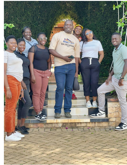
Fun times: Some ICPAU staff during the staff retreat at Masheda Palms.