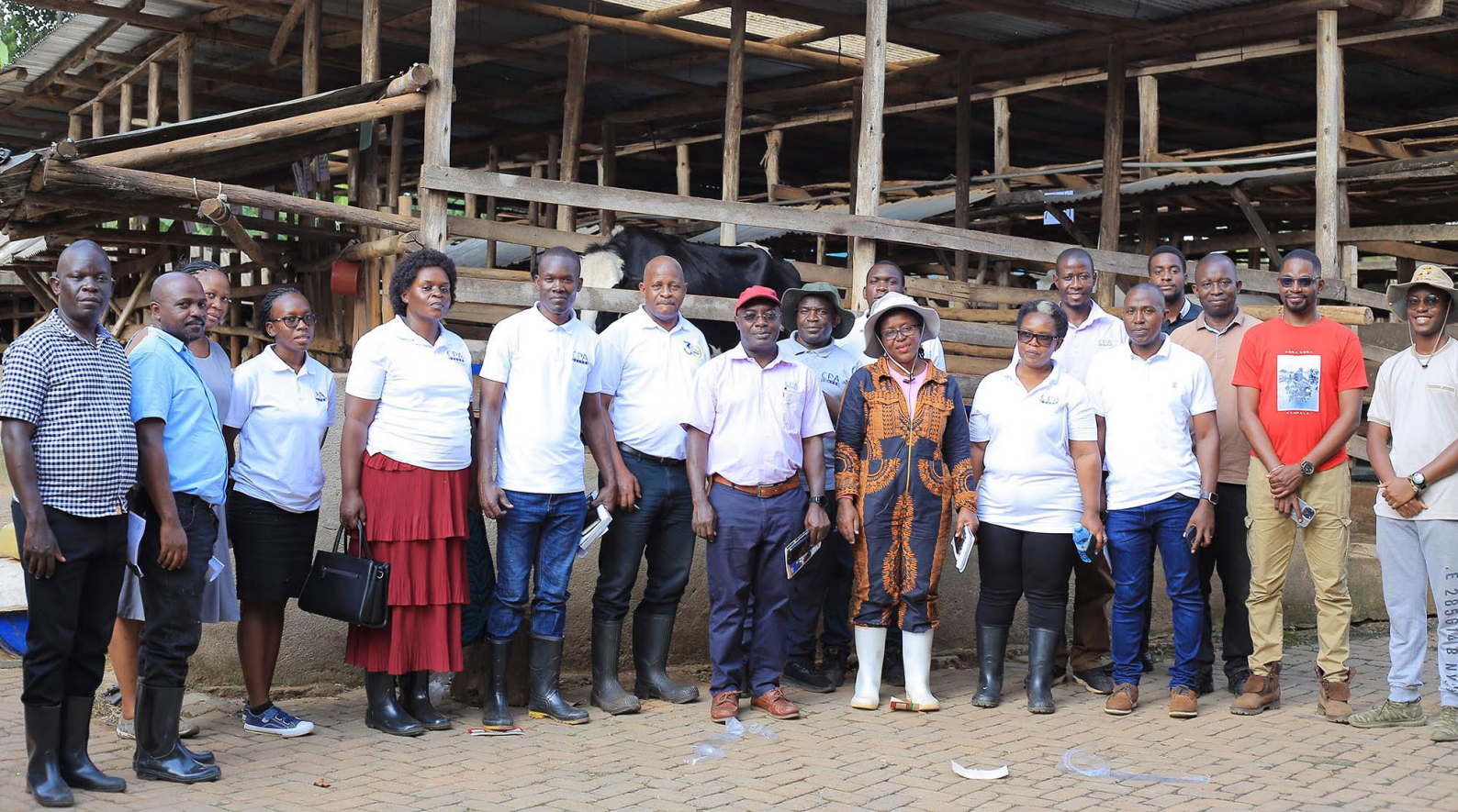
Participants pose for a group photo at Eikamiro Dairy Farm.