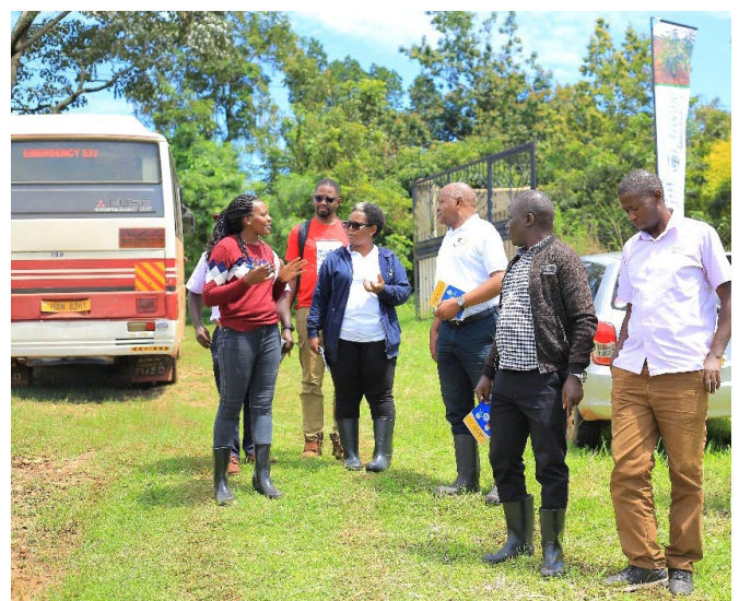
Participants arriving at Eikamiro Dairy Farm, Gayaza