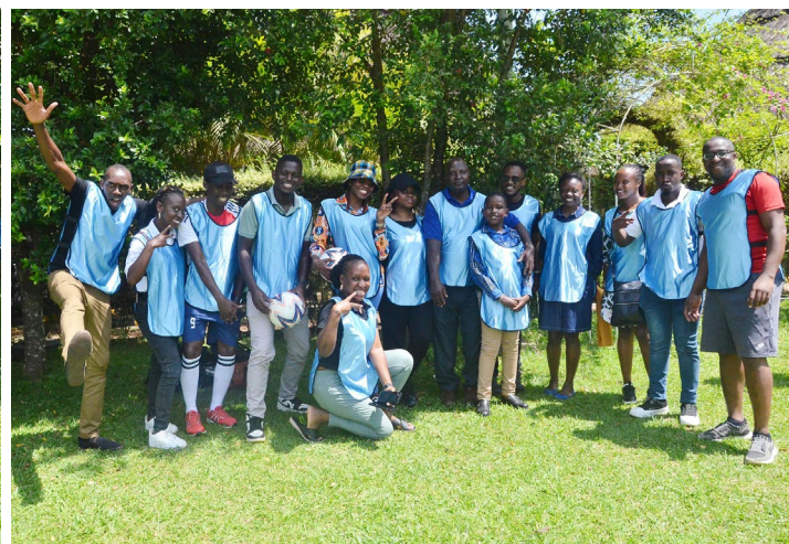
Team Spirit in Action: Celebrating fun and sportsmanship during a team-building session.