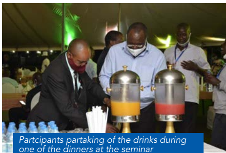
Participants partaking of the drinks during one of the dinners at the seminar