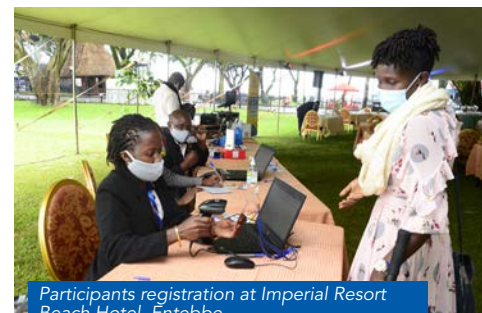
Participants registration at Imperial Resort Beach Hotel, Entebbe