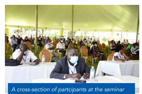
A cross-section of participants at the seminar