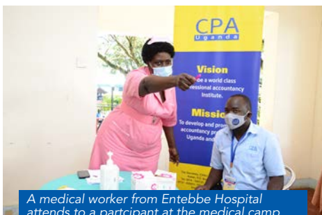
A medical worker from Entebbe Hospital attends to a participant at the medical camp