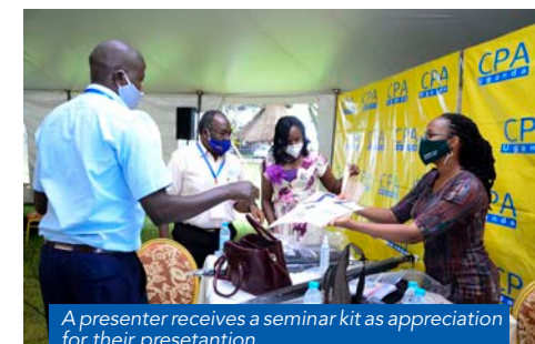
A presenter receives a seminar kit as appreciation for their presentation