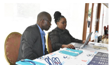
A team from Caseware Africa at the Workshop - Caseware was a sponsor of the workshop