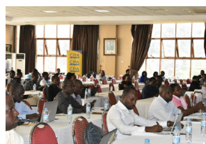
A cross section of participants at the Practical Audit Training Workshop - 19 -20 May 2022 at the Imperial Royale Hotel