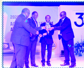
A team from BIZ & CO