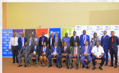
The Keynote Speaker, with ICPAU Presidents, Council members and guests from Eastern Africa