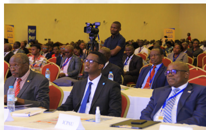
Seminar session in process