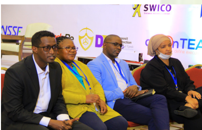
Representatives from Eastern Africa and the East African Community Institutes of Accountants