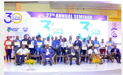
Sponsors of the 27th Annual Seminar with ICPAU dignitaries