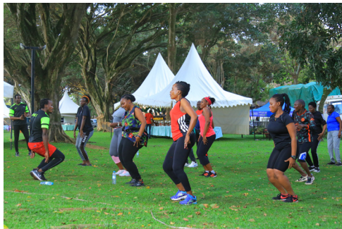
Corporate exercises in session