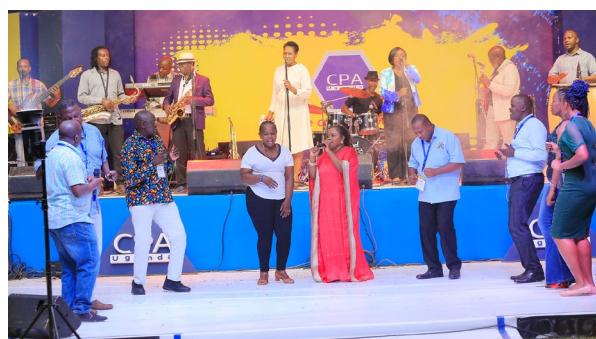
Participants enjoying the music during entertainment nights at the 12 th CPA Economic Forum.