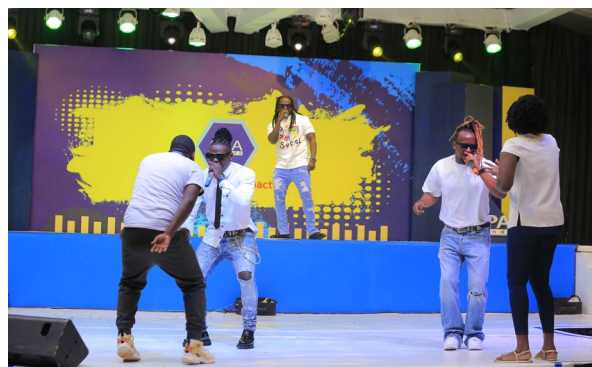
B2C entertaining participants at the 12 th CPA Economic Forum