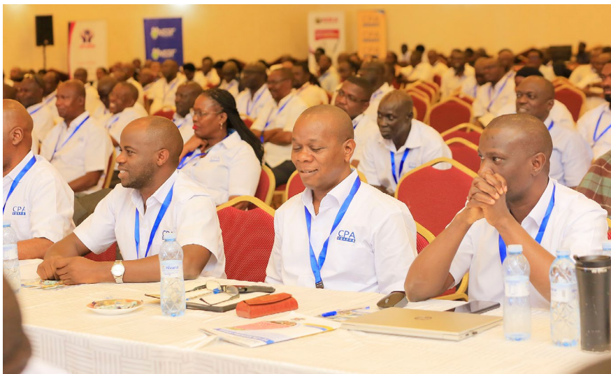
Some of the participants donning ICPAU Branded shirts and blouses at the 12 th CPA Economic Forum.