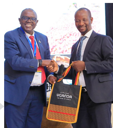
Hon. Ibrahim Ssemujju Nganda, Member of Parliament of Uganda for Kira Municipality, receiving a token of appreciation at the 12 th Economic Forum.