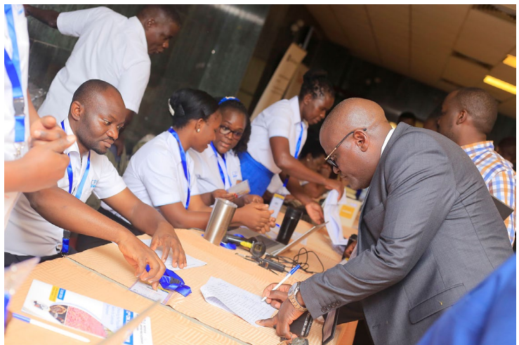
Attendees signing in at the registration desk, with staff assisting and welcoming them.