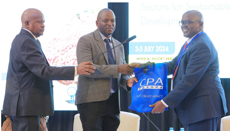
One of our Silver sponsors, Bank of Uganda receiving a token of appreciation at the 12 th CPA Economic Forum.