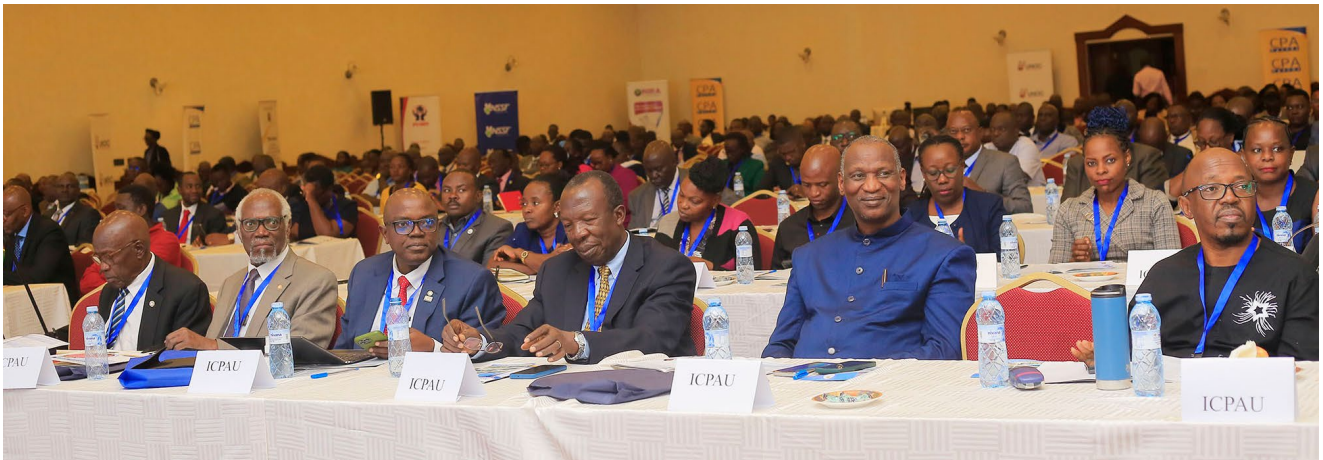
Some of the participants at the 12 th CPA Economic Forum