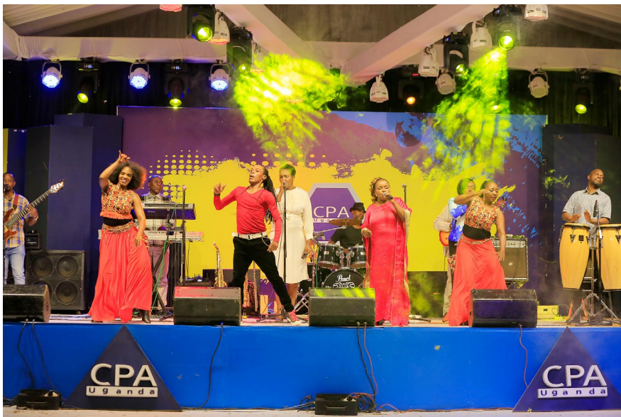
Band Night: Afrigo Band entertaining participants at the 12 th Economic Forum on day one.