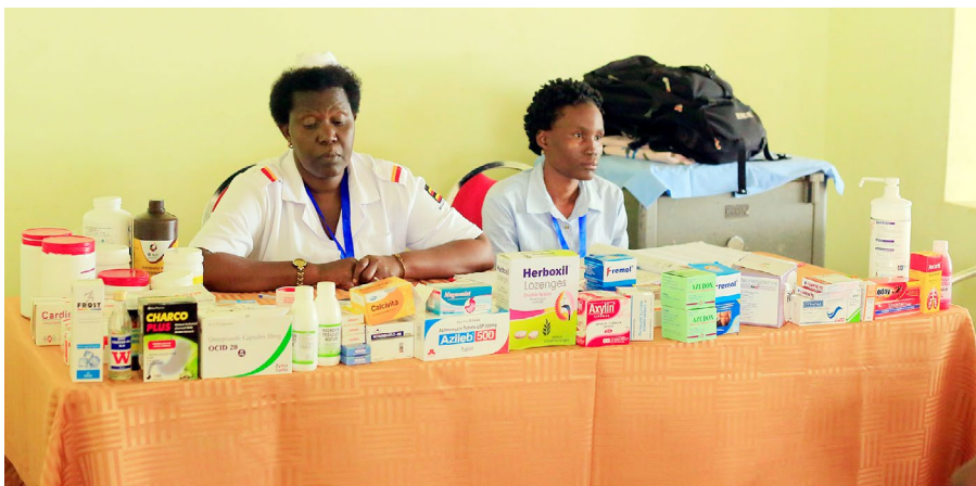
Some of the medical personnel from Entebbe National Referral Hospital at the 12 th CPA Economic Forum ready to serve participants.