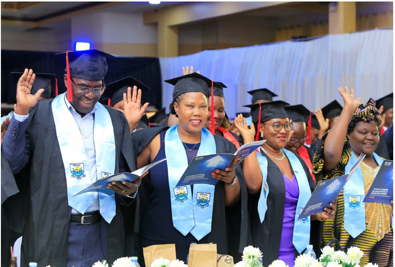
Some CPA Graduates taking the oath at the 16 th ICPAU Graduation Ceremony.