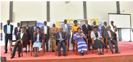
Official handover of ATD assessment to UBTEB, at UICT Nakawa on 2 November 2023.