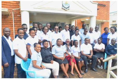
Some ICPAU staff showcasing their ICPAU-branded attire on the International Accounting Day - 10 November 2023