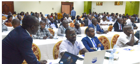
A cross section of participants at the Accountancy Practitioners' Forum on 26 October 2023, at the Imperial Royale Hotel.