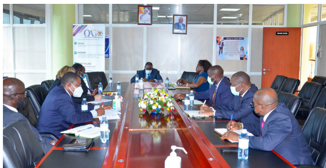
Meetings with the Office of the Auditor General officials