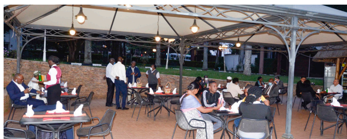
Dinner hosted by ICPAU at Lake Victoria Hotel, Entebbe