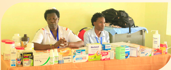
Some of the medical team from Entebbe Regional Referral Hospital at the 3 rd PFM conference ready to attend to participants.