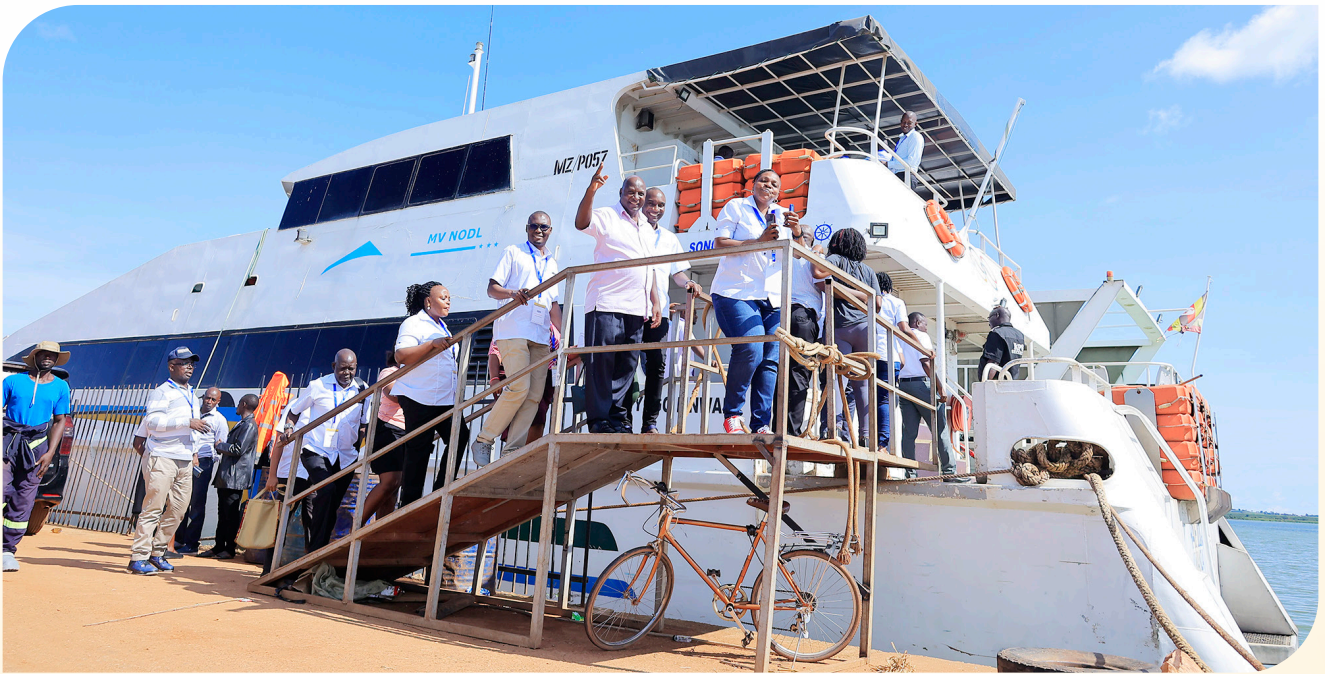
Some of the participants of the 3rd PFM conference boarding a boat for a joy-sailing activity at Nakiwogo landing site.