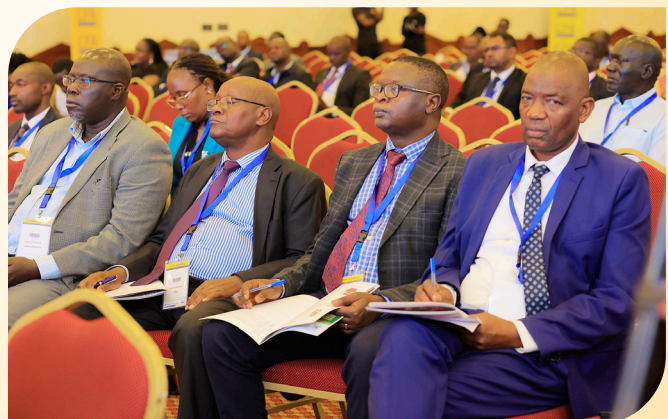
A cross section of participants at the 3 rd PFM conference.