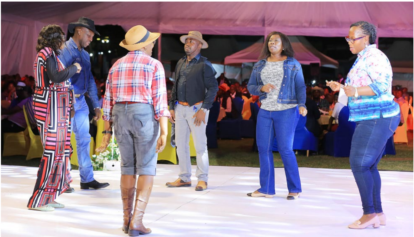
Participants dancing and enjoying the music played by the Abeeka band.