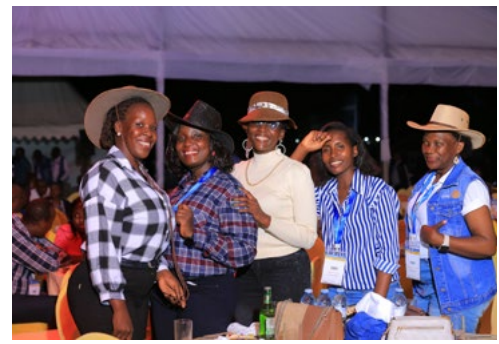
Participants dressed in a cowboy theme pose for a photo on the first day of the 29th ICPAU Annual Seminar.