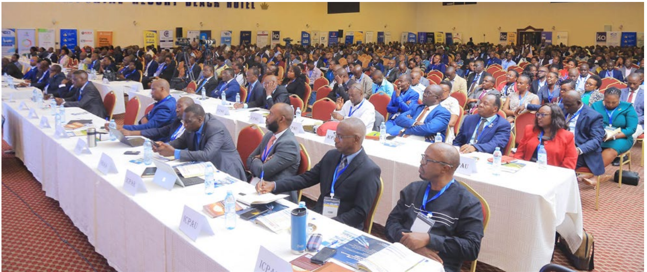
Participants at the 29th Annual Seminar.