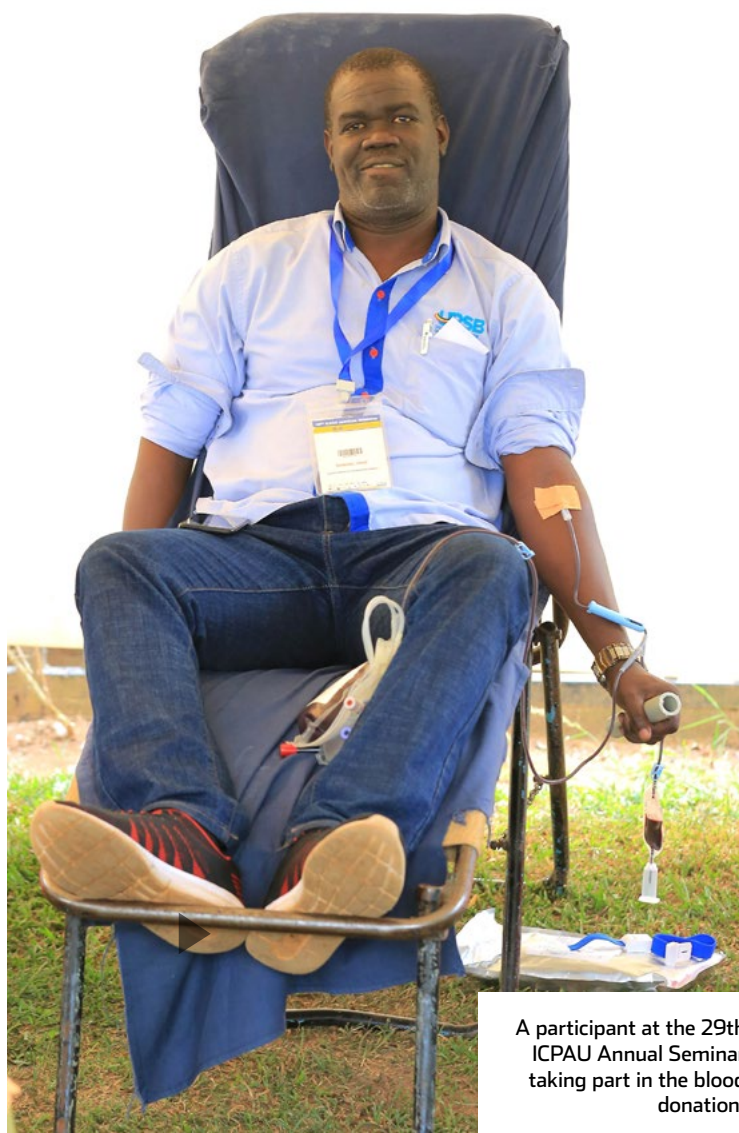
A participant at the 29th ICPAU Annual Seminar taking part in the blood donation.