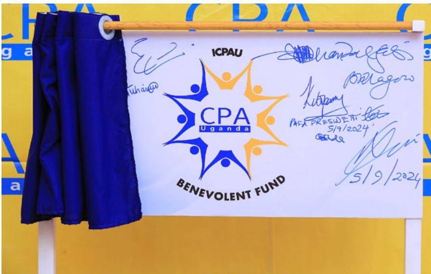
The cortex board, bearing multiple signatures, marking the launch of the Benevolent Fund at the 29th ICPAU Annual Seminar.