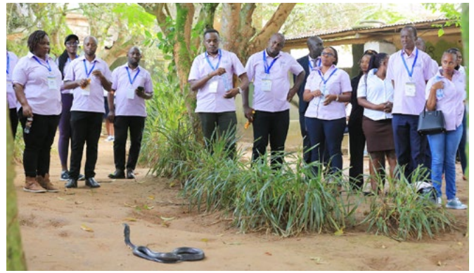
Participants at the Uganda Reptile Village in Entebbe.