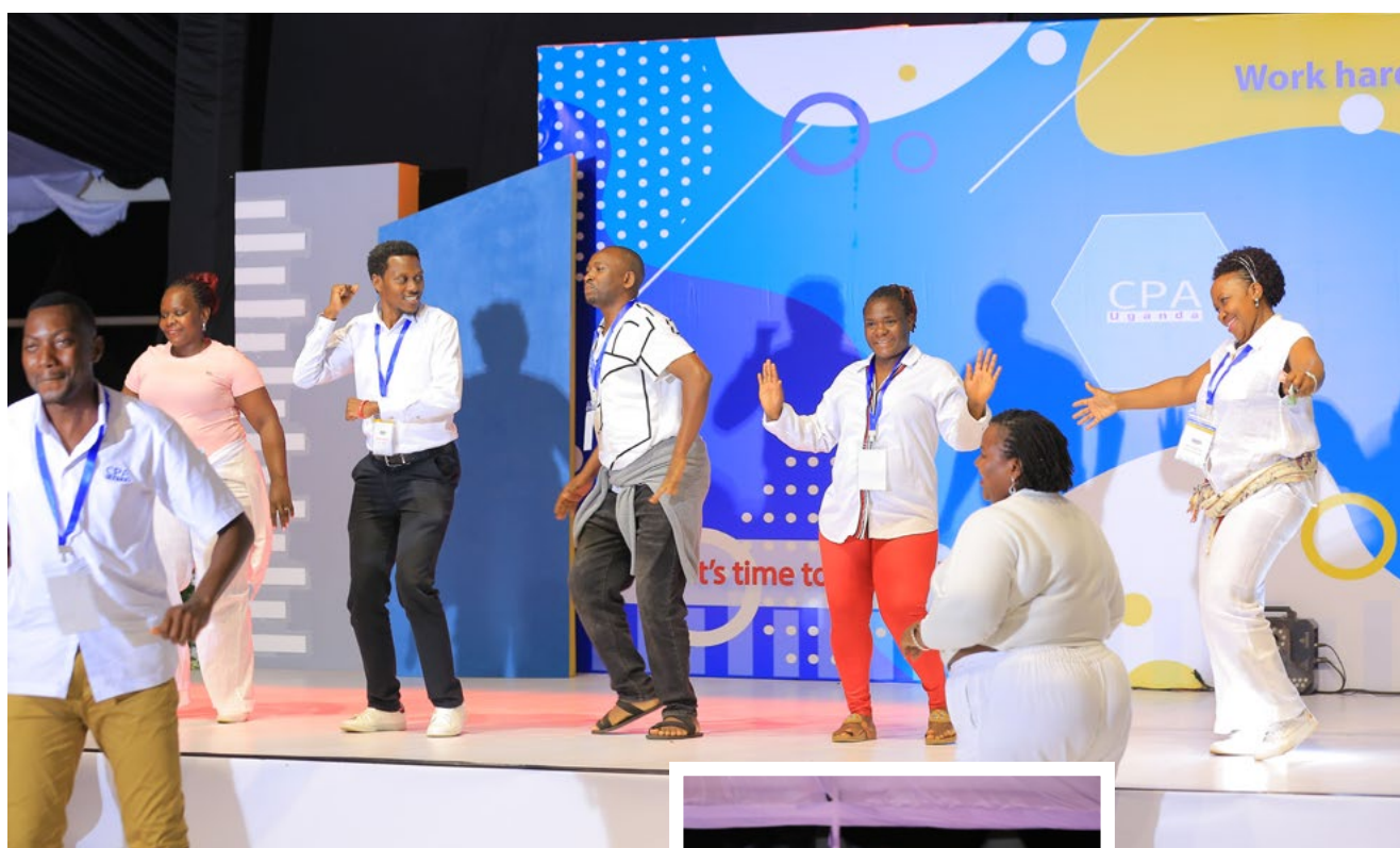
Participants dancing and enjoying the music played by Azawi.